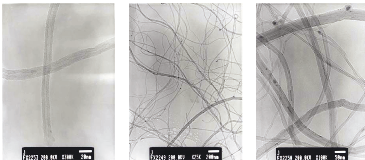
Figure 1 TEM images of originally synthesized CNTs. TEM, transmission electron microscopy.

From the residual weights of materials after heat treatment under helium, an increase in weight loss (due to